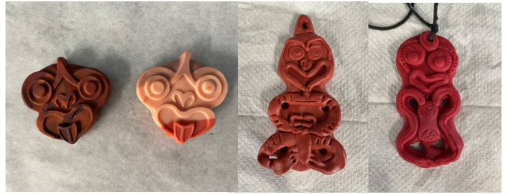
Student Artwork: Hei Tiki made during Te Wiki o te Reo Māori