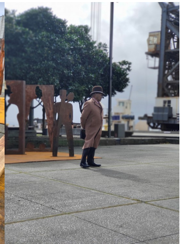
Tāme Iti with his installation I Will Not Speak Māori.