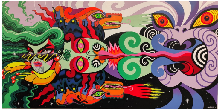
The artwork of Xoe Hall seen at Te Waka Huia o Ngā Taonga Tuku Iho (Wellington Museum)